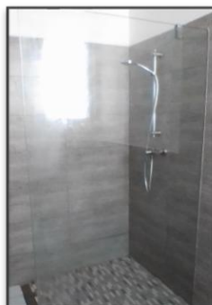
Walk In Showers