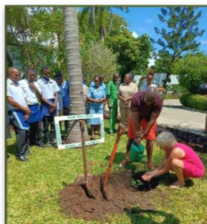
Tree planting exercise by Staff & Guests